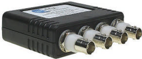
Quad Video Balun BNC Female Bulkhead Panel Mount Part Number: E10172B

Note: An Installation Guide for Video Balun installations is available on request. For optimum results the recommendations provided in the guide must be followed.