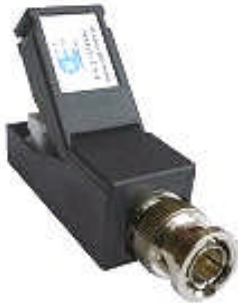
Quick Connect Video Balun BNC Male to IDC Part Number: E10180C