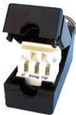
Rear View showing IDC

The video balun will enable video signal to be interfaced using coaxial on one side to Cat 5 twisted pair cabling on the other using Insulation Displacement Connector to achieve quick and reliable connections.