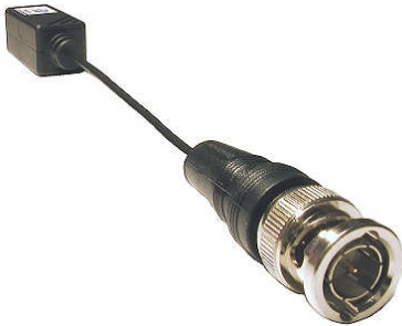
Video Balun BNC Male to RJ45 Part Number: E10180T