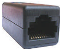
Rear View Showing RJ45 Jack