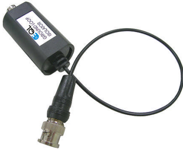
Ground Loop Isolator BNC Male with 100mm Mini Coax to BNC Female Part Number: E10500