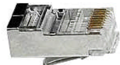
Shielded RJ45 Plug