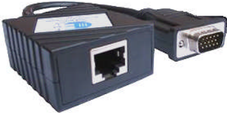
PC Balun Part No: E10680C