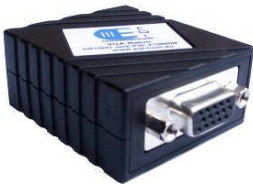
Monitor Balun Part No: E10680M

The VGA Balun has been specifically designed to allow a VGA Monitor to be remotely located from the computer. The VGA Balun comprises a PC Balun and a Monitor Balun. They must be used together as a pair. Shielded Category 5e cable terminated in shielded RJ45 Plug must be used to interconnect the 2 units otherwise there will be picture distortion.